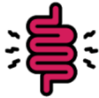
Stomach and digestion problems