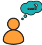
Trouble with concentration, memory, or thinking clearly