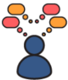
Uncontrollable worry or dread

It is normal to be worried and stressed during times of crisis. While worry is a part of anxiety, people with anxiety tend to experience more exaggerated feelings of worry and tension. Some common symptoms include: